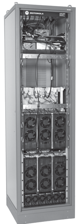
GTR 8000 Expandable Site Subsystem

Designed to carry your needs into the future, the G-series hardware platform has built-in functionality and flexibility with an AC/DC - 48VDC power supply and two-branch receive diversity capacity, as well as a linear power amplifier for improved coverage in P25 FDMA Simulcast systems.